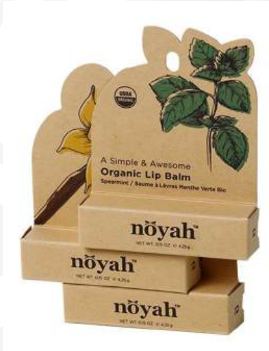
Kraft Hanger Box