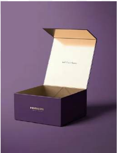
Flip Top Boxes