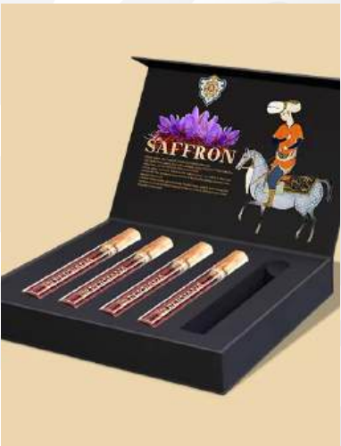
Hard Box Packaging