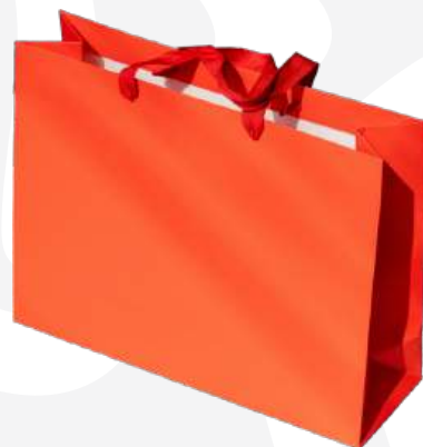
Custom Paper Bags