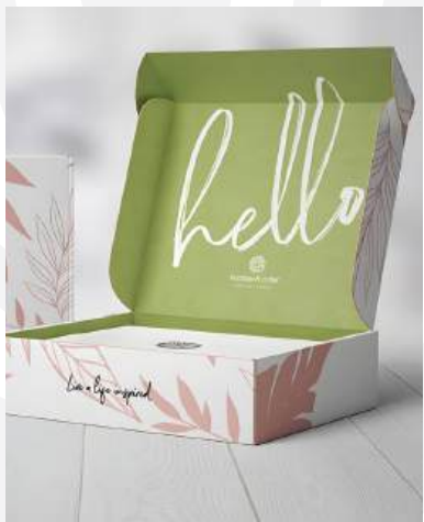
Both Side Mailer Box