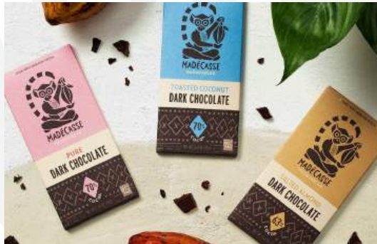
Chocolates Paper Wraps