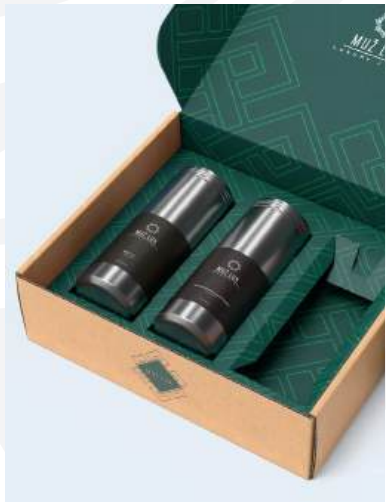
Corrugated Mailer Box

The mailer boxes are the boxes we utilize to mail things. The flaps and wings interlock, making assembly simple and preventing the need for adhesive tape to close. Compared to other varieties of paperboard packaging, the mailer box is stronger and more transport-resistant due to its two side walls. This allows for several uses of it. For packaging, somewhat bigger things, or even a dozen little products, as many subscription boxes do, mailer boxes are an excellent solution.