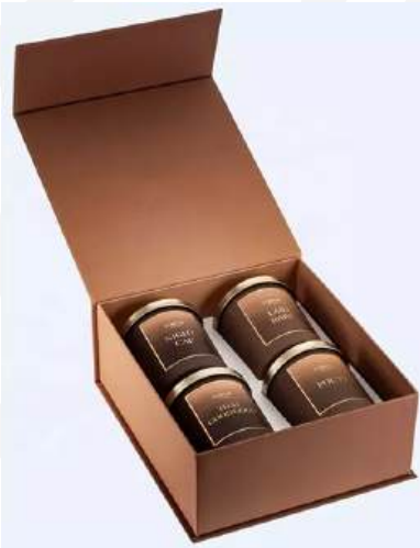
Rigid Candle Packaging