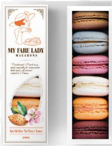
Luxury Macron Boxes