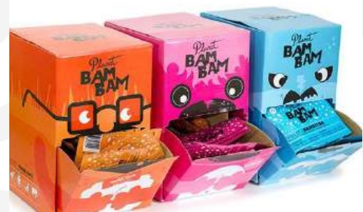
Gravity Dispenser Boxes