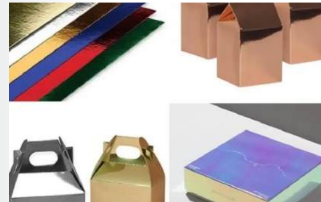
Metallic Card Stock