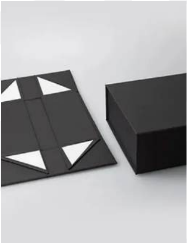
Foldable Rigid Boxes

Custom rigid boxes are premium solutions that make a lasting impression. Perfect for gifts, special occasions, or adding a touch of luxury to everyday items, our custom rigid packaging comes in various sizes, styles, and finishes to suit your needs.