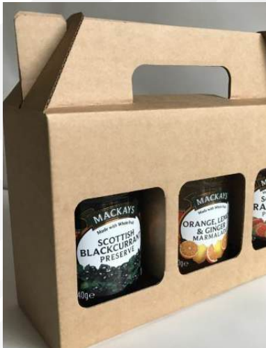
Kraft Gable Boxes