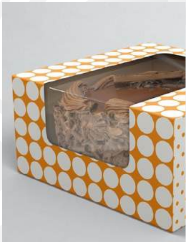
Cake Boxes + PVC