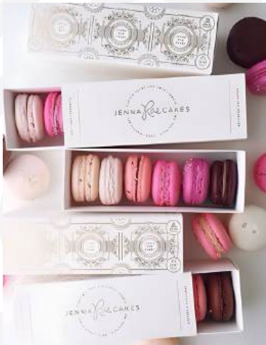
Sleeve Tray Boxes