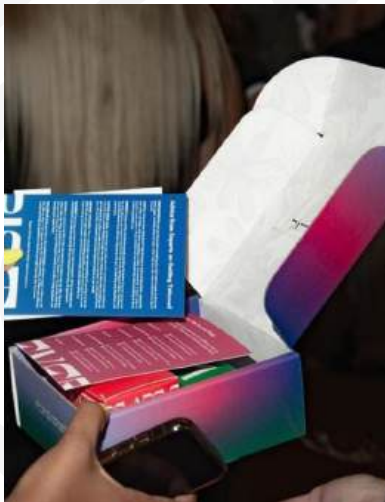
Custom Mailer Boxes