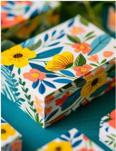
2 Side Printing