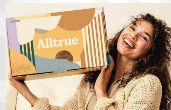
Retails Ship Boxes