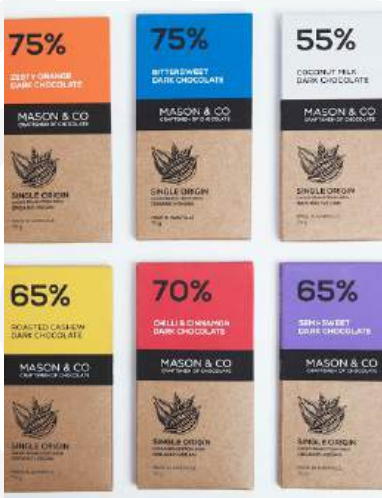
Kraft Chocolate Boxes