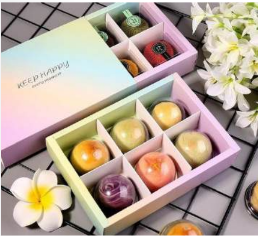
Luxury Bath Bomb Boxes