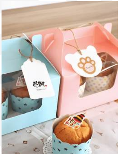
Gable Boxes + PVC

We can help you package cakes, donuts, cookies, cupcakes, and any other mouthwatering treat. Our paper food boxes are available in a variety of colors, including white, conventional pink, wrap-around windows, top windows, doughnut boxes, macaron boxes, and even boxes with top straps and edge windows that truly highlight your goods