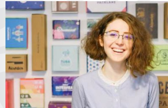
Versatile Box Materials