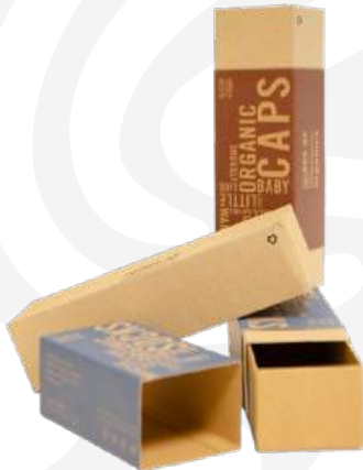
Kraft Sleeve Boxes