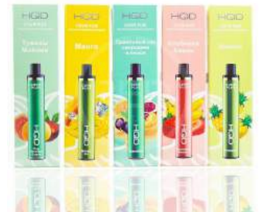
Premium Vape Box