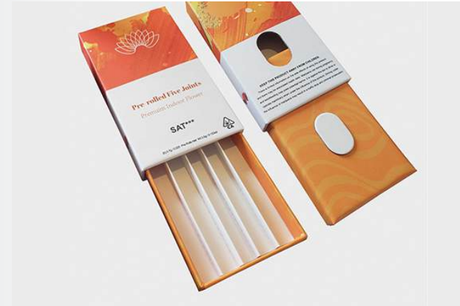
Child Resistant Boxes