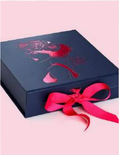
Rigid Gift Boxes