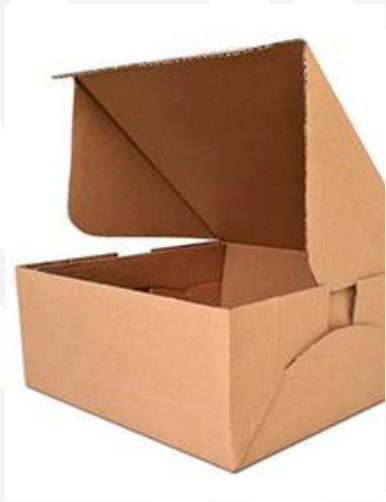
Kraft Cake Boxes