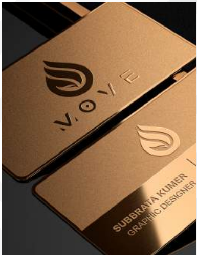
Gold Foil Business Card