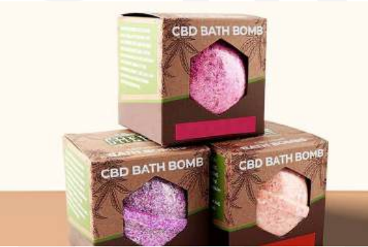
CBD Bath Bomb Boxes