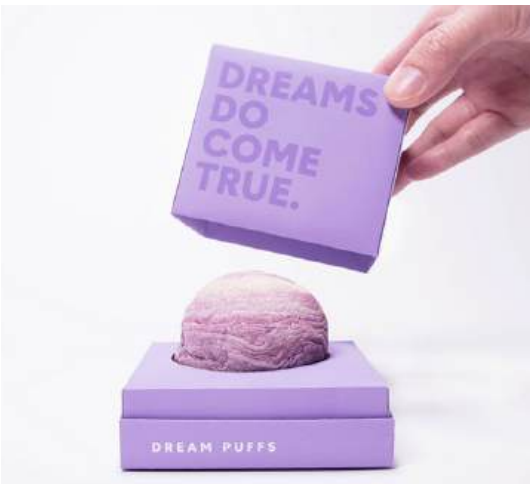
2 Piece Bath Bomb Boxes