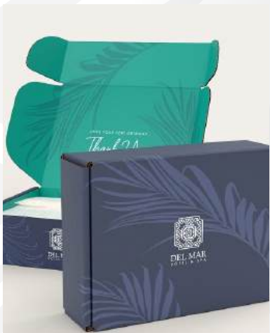
Tuck Top Mailer Boxes