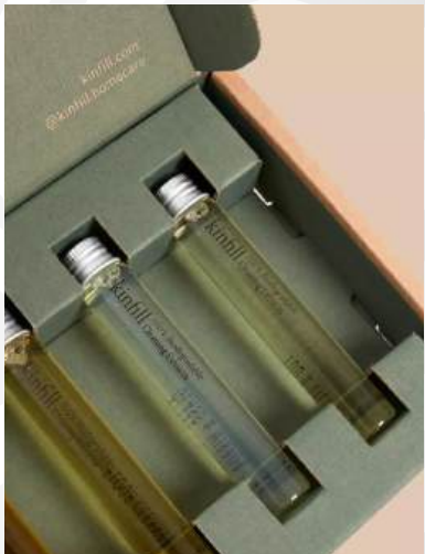
Colored Mailer Boxes