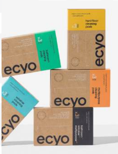
Kraft Soap Boxes

Eco-friendly options that align with your environment for a greener tomorrow. Let's upgrade your packaging game and attract more customers today with We Print Boxes!