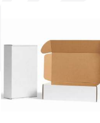
White Mailer Box