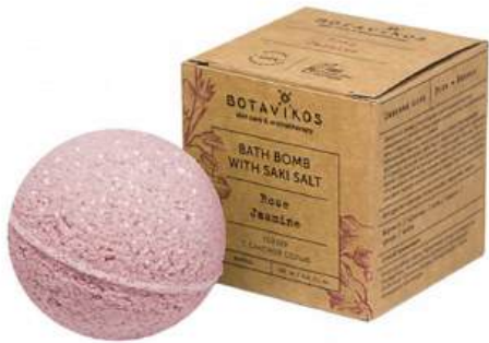
Kraft Bath Bomb Boxes