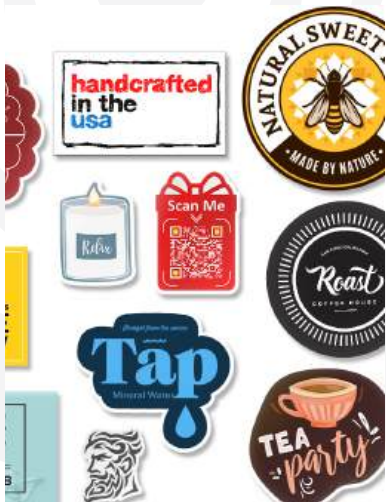
Custom Logo Decals