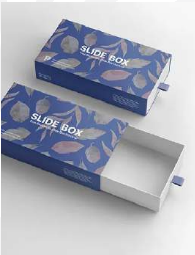
Slide Box Packaging