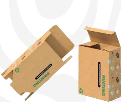
Kraft Snap Lock Boxes