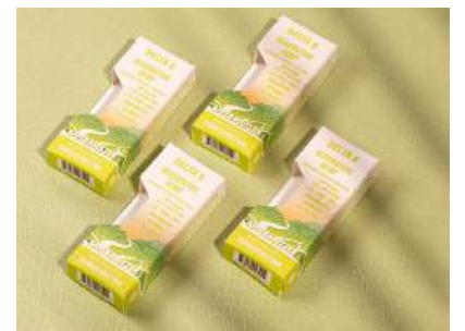
DieCut Vape Boxes