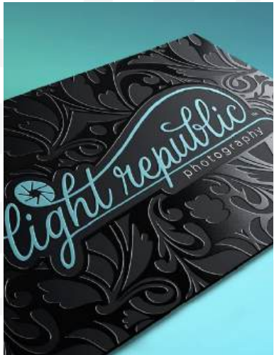
Spot Uv Business Card